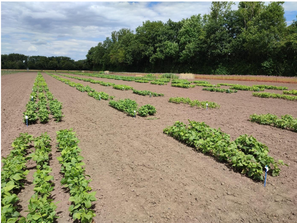
Figure 7. Field trial of bush beans at the IPK Gatersleben (Germany) in 2024 for phenotyping and seed propagation

Phaseolus beans (or common beans, Phaseolus vulgaris L. and P. coccineus (scarlet runner bean)) are the second most important cultivated legume type in the world, grown as bush beans or pole bean for their green pods and for dry seeds (37 million ha, FAOStat 2022). In Europe, phaseolus beans are traditional food crops with 191,068 ha grown in 2022 for grain and 124,865 ha grown for the green, vegetable consumption. Almost all cropping is for food quality with 18 dry bean production chains protected by Protected Geographical Indication (PGI) and Protected Designation of Origin (PDO). Despite our substantial research base, the wider growing market for beans used in sustainable healthy diets will be met by more imports unless the European crop is revived. This revival is the goal of our Legume Generation Phaseolus Bean Innovation Community (BIC): a group of breeders and research scientist from both commercial and academic organisations, spread over six countries. Our community has already grown beyond the project partnership and now includes Van Waveren Seeds and Pharmaplant GmbH.