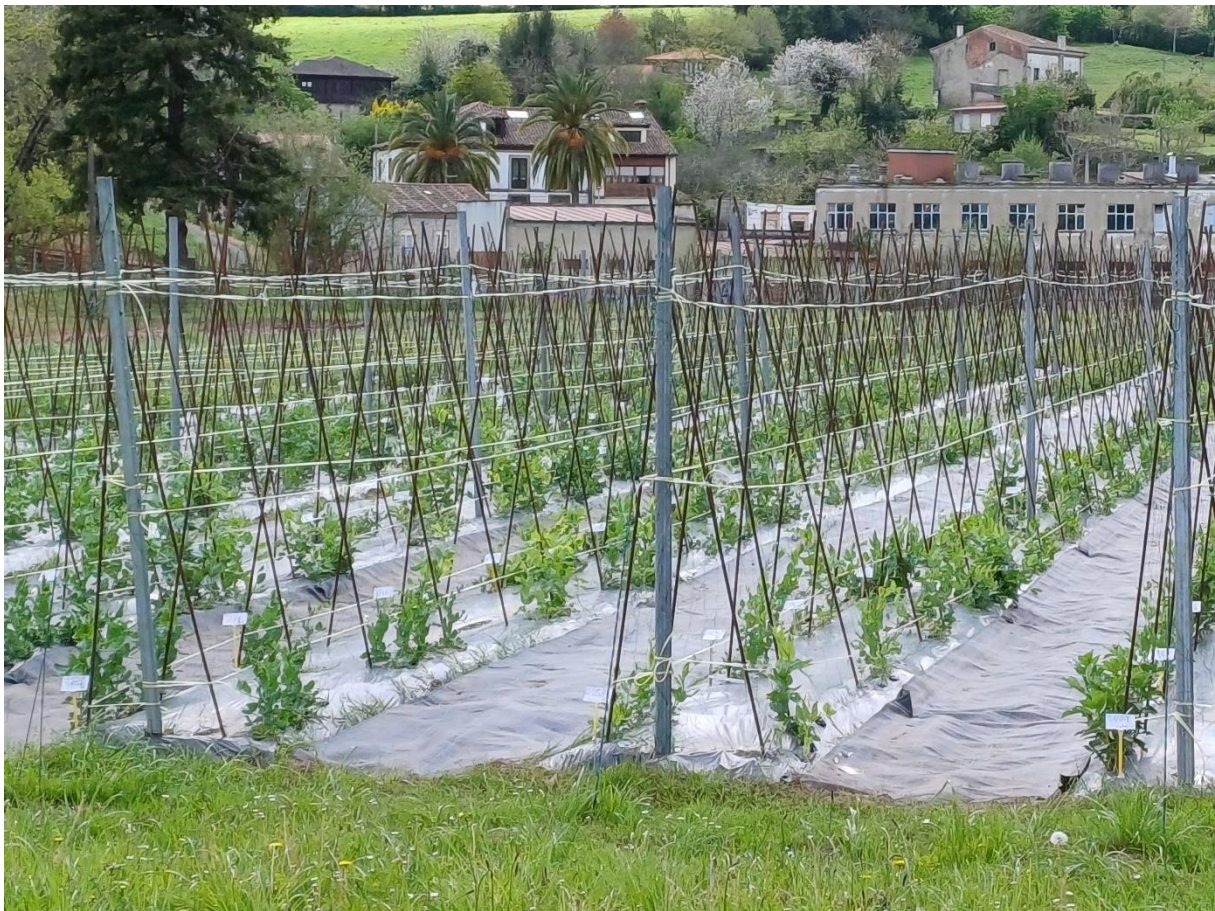
Figure 5. A pea field trial conducted at SERIDA in Spain in 2024.

fit to practicable breeding. The network will serve the translation of research findings into improved cultivars coping with current and future challenges in peas as a feed and food crop.