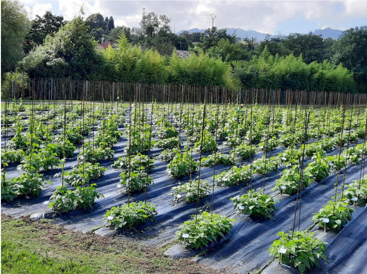
Figure 8. Phaseolus bean field trial at SERIDA (Spain) in 2024.