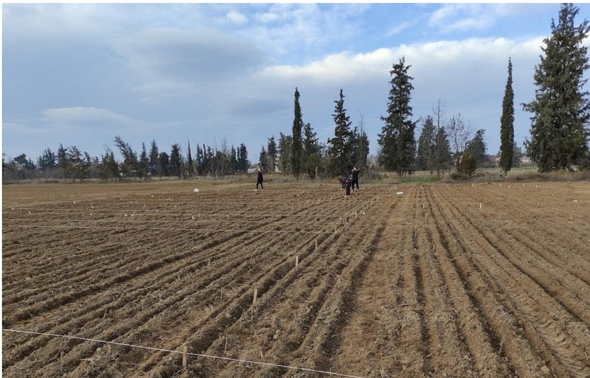
Figure 4. Sowing lupin trials in Greece.

All this is done within the long-term framework of ESKUSA's breeding programme. A key for the success of the LUPIC will be cooperation across the different species. We need to develop a trans-species point of view in our activities to join our forces, grow together and to solve problems in common. Because ESKUSA is a breeding company, we identified our most important breeding goals from farmers' needs and transfer these into cultivar-development. We are open to share our approaches with other breeders and scientists.