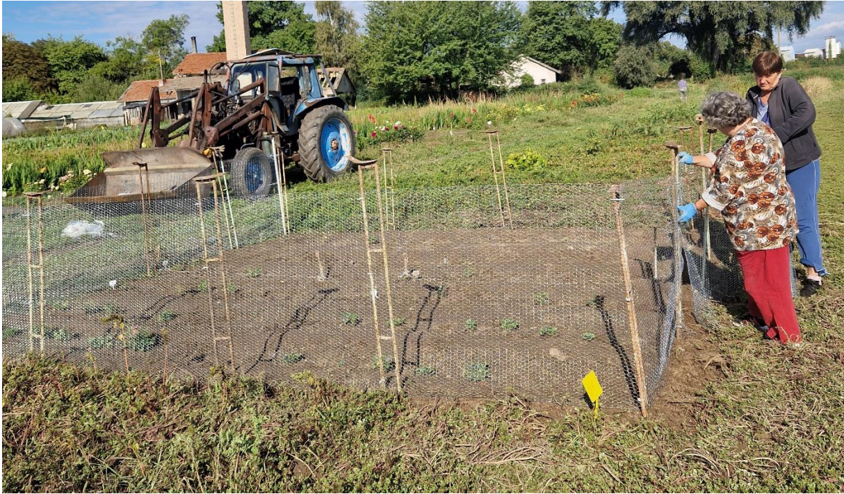
Figure 9. Erecting a security net around a ABI field test of clover at Negovan in Bulgaria.

Increasing seed yield, especially in red clover, will boost innovation from new germplasm and the use of red clover on farms. We are assessing two approaches to improving seed yield. Boron applications, carried out at the ABI in Bulgaria and Germinal/IBERS (UK), will test effects on pollen tube growth, seed production and viability. Foliage, of poor seed yielding varieties, will be sprayed with 0.75mg/l of boron, in both field and glasshouse experiments.