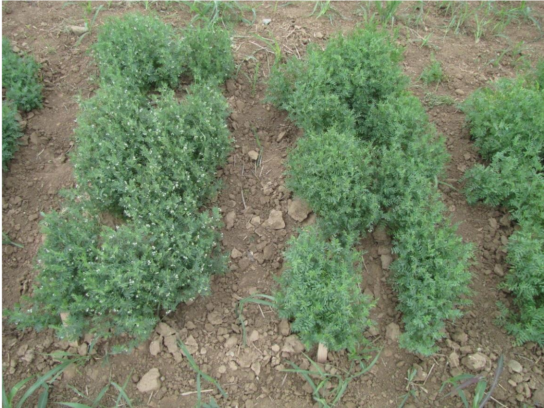
Figure 6. Variation in flowering date measured in the phenotyping of lentil at the IHU in Greece.

Our germplasm includes 180 accessions from the IPK that are tested at 4 sites in Greece, France and Germany, and partly at a fifth site in Italy. We are also testing a further 220 accessions, including landraces and improved lines, mainly originated from ICARDA in Greece (IHU) and 200 lines mainly originating from previous project (UNIBAS, Italy) and (KEY, Germany). Standard measurement protocols are being used. The follow-on work will include the further development of single seed descent lines, and the identification of genotypes that make an efficient use of resources across environments.